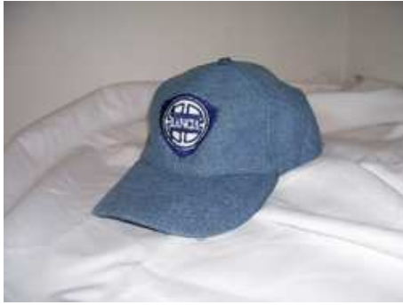
Lancia Baseball-style Caps – R75 each